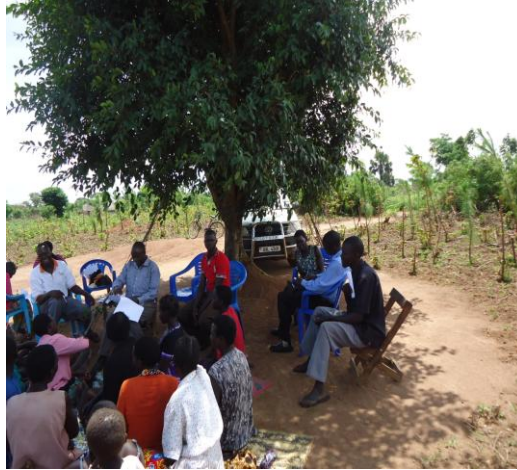
Baseline survey in Otwal Sub county-Oyam district