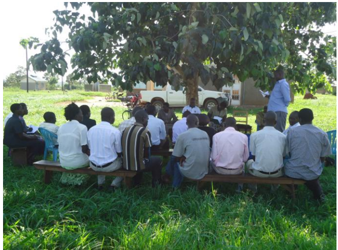
UCAA Meeting with Local leaders in Oyam.