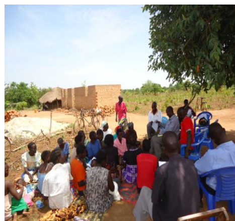
Sensitization in Gulu