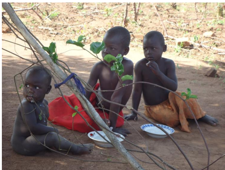
Children of women in Otwal talking porridge for their lunch

4 Community Sensitization was conducted by the UCAA staff and the Change agents. In Unyama sub county Gulu, Sensitization was in the parish of Unyama – awich village and Pangea- Oguro Village. The project Purpose, target , funder and implementer were all made clear to the community members who had gathered to hear what UCAA was bringing to their Community. Included in the gathering were 22 women beneficiaries on the project. Similar meetings were conducted in Otwal Sub county in Alege and Okii Parishes. Included in the gatherings were women beneficiaries who totaled to 29