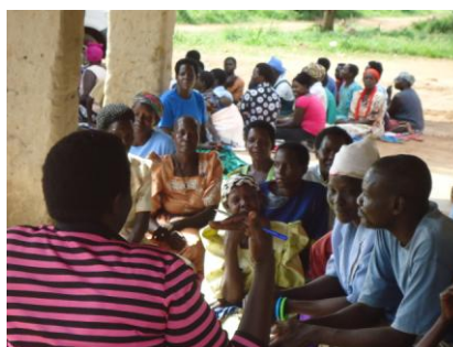
Otwal Primary School hoisted a sensitization session

Martyrs University presenting her daily activity reports to UCAA Programme Director.