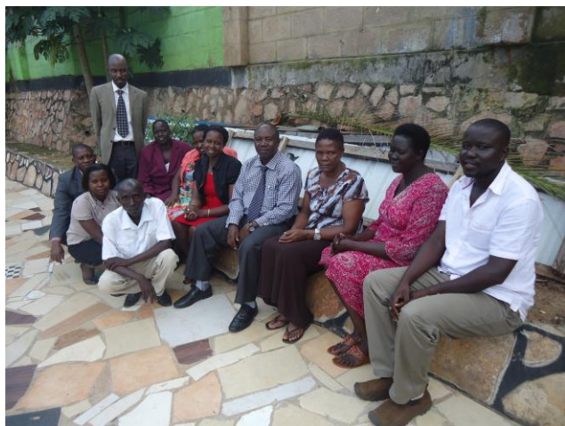
Some UCAA staff after training in M&E at Keba INN Entebbe