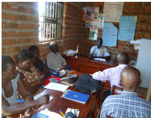
Meeting with Unyama Sub county leaders after launch of the Project.