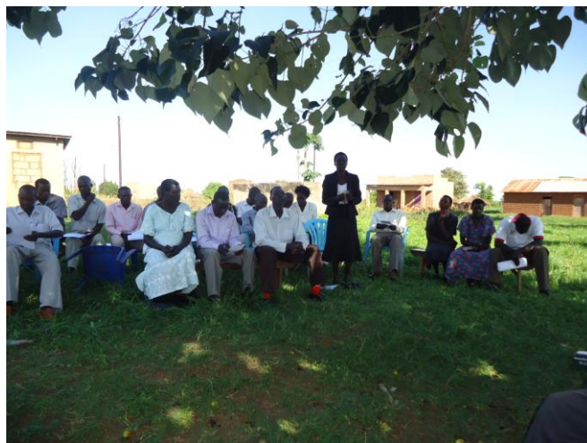
The Vice Chairperson Local council III of Otwal Sub county, gives an address at the Launch of the project at Otwal Sub county Headquarters in Oyam district.

The Project was launched in both Otwal Sub county of Oyam district and Unyama sub county of Gulu district. In attendance were a total of 66 community members including the sub county and district leadership as well. At the launches the project funder, purpose, target area and the reason why the direct beneficiaries must be women were highlighted by the UCAA staff. The Local leadership in both districts welcomed the Project, thanked UCAA and Finn-Church women's bank for bringing the project. They promised support to UCAA in providing a conducive environment for project implementation. Speeches from the beneficiaries indicated that they were happy with the project and pledged to be active in its implementation.